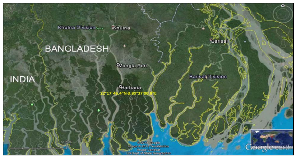
Fig 2: Location of the site of present record of the Neptis soma shania, Harbaria, Sundarbans

Gewa ( Excoecaria agallocha ), and Saila ( Sonneratia caseolaris ). Besides, there are some herbs and shrubs which further supplement for the habitats of butterflies. Of these, Khulsi ( Aegiceras corniculatum ), Hargoza ( Acanthus ilicifolius ), Baoli lata ( Sarcolobus globosus ), Akond ( Calotropris procera ), Asam lata ( Mikania scandens ), Ipomoea ( Ipomoea illustris ), Tylophora ( Tylophora tenuis ) and Wedelia ( Wedelia biflora ) are notable.