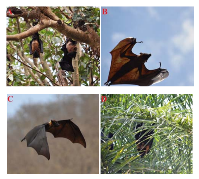
Fig 2: A. Roosting of P. giganteus on gular tree; B , C. Flight posture of Pteropus giganteus , Ventral view ( B ), Dorsal view ( C ); D . P. giganteus on date date palm tree

Roosting of Indian flying fox Pteropus giganteus (Brünnich, 1782) (Figure 2A) on arjun (Terminalia arjuna) and gular (Ficus racemosa) trees was observed at two sites; Talvriksha village (27°28'37.84" N; 76°23'38.61" E) and Silisedh (27°30'57.18" N; 76°32'0.86" E). Both the locations were on village road sides and surrounded by human settlements. At Talvriksha village more than a hundred bats were roosting on an arjun tree. They were found flying at regular intervals (Figures 2 B & C). Intra-specific competition for space was observed among these bats as some of them were struggling to get more space. A few were seen flying to a nearby date palm tree (Phoenix dactylifera) (Figure 2D) where they found to crack and suck its fruit for some time and again return to their roosting tree. Inter-specific competition with common crows was also observed in this colony. At Silisedh, more than two hundred bats were observed roosting on two gular trees adjacent to each other. To get rid of rain, these bats were trying to hide their body inside patagia. Intra-specific competition for space and flying at regular intervals was also observed in this colony.