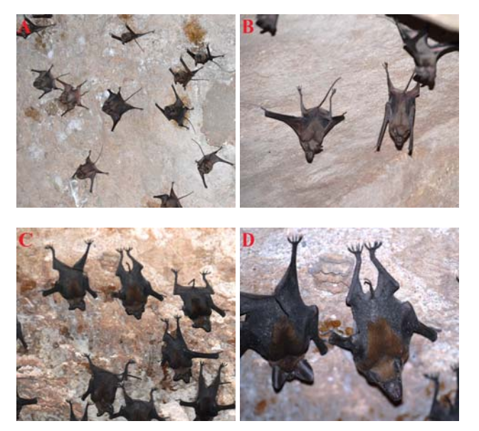
Fig 3: A. Mixed colony of Rhinopoma hardwickii and R. microphyllum ; B. Colony of R. hardwickii ; C, D. Colony of R. microphyllum

Mixed colony of lesser mouse-tailed bat Rhinopoma hardwickii Gray, 1831 and greater mouse-tailed bat Rhinopoma microphyllum (Brünnich, 1792) (Figure 3A) was observed at Bhangarh fort (27°05'45.93" N, 76°17'21.98" E). Both the species are insectivorous and found to coexist in this fort. Basically two types of roosting sites of these bats were observed inside the fort; in water storage tanks (on walls) and inside low and medium height buildings (on walls and roof). These places were entirely dark and devoid of sunlight during the day time. Population of 50-100 individuals of both species was observed at each roosting site. In total, population of about five hundred individuals of these bats were observed including all rooms and storage tanks, and the number of R. hardwickii (Figure 3B) individuals was less in comparison to R. microphyllum (Figure 3 C & D) in the entire chiropteran colony of the fort.