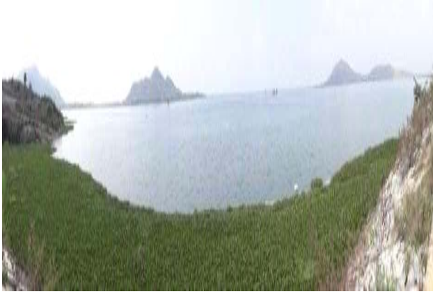
Fig 1: Study area

They were brought to laboratory noting down the colour and other morphological features and the specimens were preserved in 4% formalin. Seasonal collections were made from January 2014 to June 2014 spanning over a period of six months.