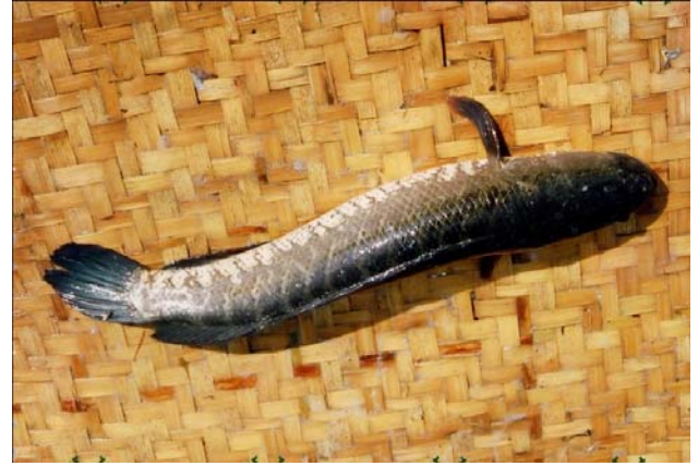
b. Channa striatus

Images: Images of fishes in study area, (a, b)