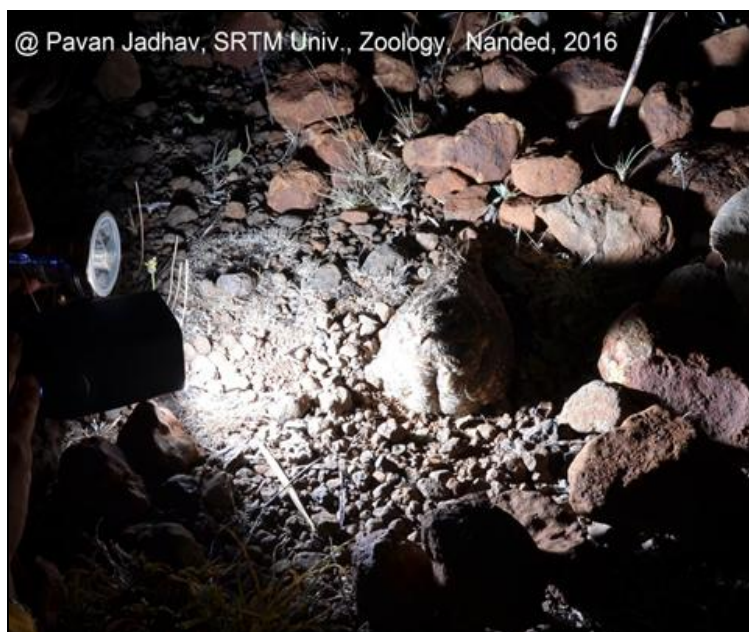
Fig 2: To the extent one can reach close to the Nightjar when it incubates eggs. It remains undisturbed till it gets disturbed by observer. (One of the authors PJ could observe it closely).