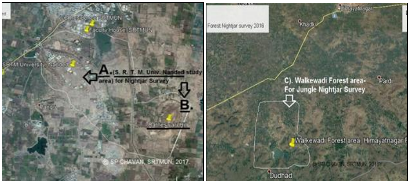
Fig 1: Study area A) SRTM University, Nanded; B) Ratneshwari Hill area. C) Walkewadi Forest, Himayatnagar Range, Nanded District, Maharashtra.