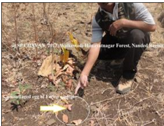
Fig 5: Single Egg of Forest Nightjar ( Caprimulgus indicus ) in open ground nest (Study area C). See the similarity with leaf color.