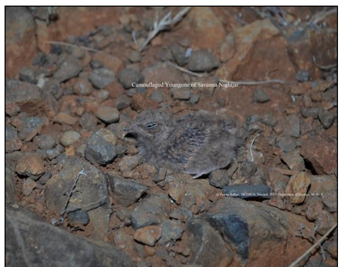
Fig 7: Highly Camouflaged Young one of Savanna nightjar in the scrubland with boulders and gravels.