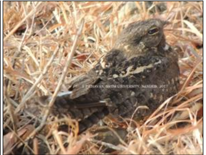
Fig 3: Savannah Nightjar ( Caprimulgus affinis ) in S. R. T. M. University, Nanded.