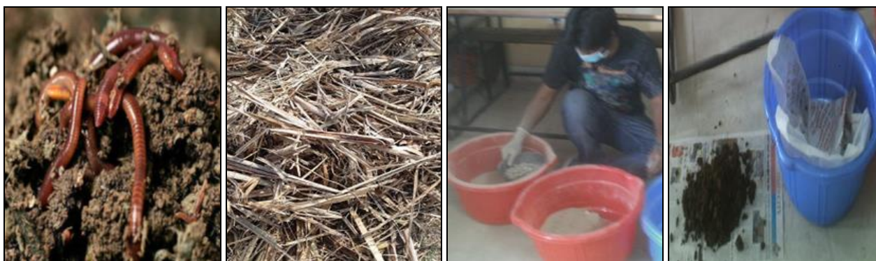
Fig 1: Eisenia fetida Fig. 2. Sugarcane trash Fig.3. Coal fly ash Fig. 4 Treatment Design

Treatment Design: The ST and CD were dried in air at room temperature. CFA was mixed with ST and CD in different ratios in order to produce different treatments (dry weight proportion). The stock culture of the earthworm was maintained in plastic containers using cow dung as growth medium in laboratory condition. This was further used in the vermicomposting experiment. The main physicochemical characteristics of all the three amended materials, i.e., CD, CFA and ST are given in Table 1. The compositions of CFA, ST and CD in different treatments are described in Table. 1