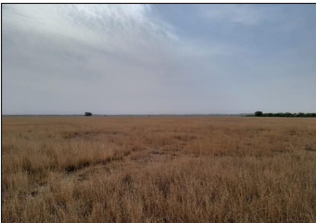
Fig 3: Grassland of Sanctuary in Summer Season

Flora: 78 angiosperm species have been found in the Sanctuary. Of which the Family Poaceae was found in maximum numbers. The grass Dichanthium annulatum was found to be the most dominant growing type (Fig 3). Acacia nilotica was found to be the most dominant tree.