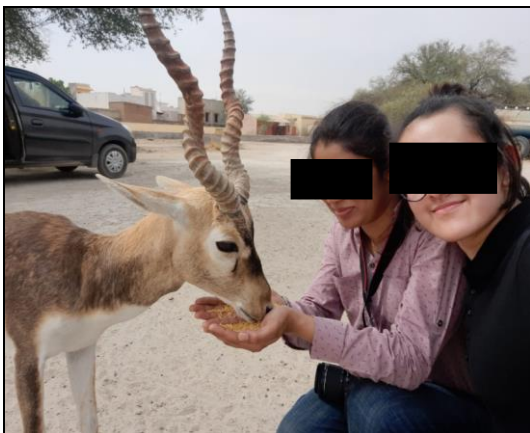
Fig 4: Realistic Ecotourism