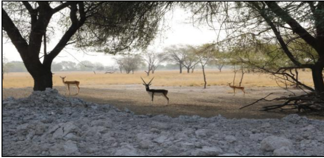
Fig 2: Blackbuck in Tal Chhappar Sanctuary

grassland having dominant form of Dichanthium and Lasiurus grasses. Tal Chhappar Sanctuary is lively with the beautiful songs of birds like harriers, sparrow hawk, skylark, dove, blue jay, southern grey shrike, Indian spotted creeper, green bee eaters, black ibis, Peacock, and Kingfisher. The sanctuary is famous for the dominant fauna the blackbuck which are found moving all around the Sanctuary (Fig 2)