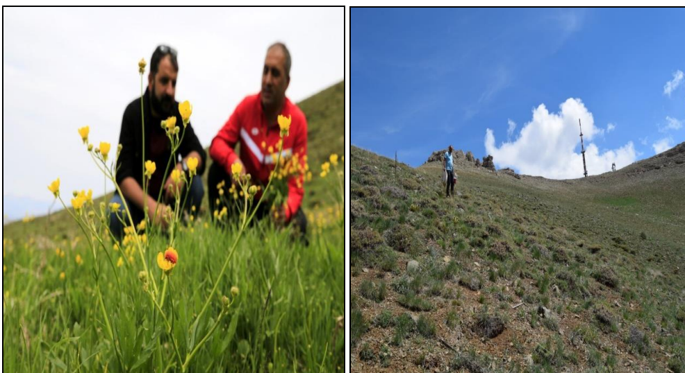
Fig 3: The Habitat of Pygopleurus koniae (Petrovitz, 1957) 4 on Hasan (Haroğlu) Mountain, 2340 m.

In conclusion, the species was named after its appearance as if wearing a fur coat and also after its feeding on the pollens of wedding flower and its abundance on these flowers. The Wedding Beetle with Velvet Fur were seen in abundance on wedding flowers between the dates 01.05.2021 and 15.05.2021, and it was also found that they had their reproduction activities on the flowers. Location of the species and three-week population fluctuations are given in Figures 3 and 4.