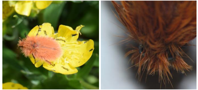
Fig 2: The Habitus of Pygopleurus koniae (Petrovitz, 1957) and its blue compound eyes.

a pet reduced to micro size, and has perfectly blue eyes in close take (Figure 2). Additionally; it was observed that the species has a strong sexual dimorphism