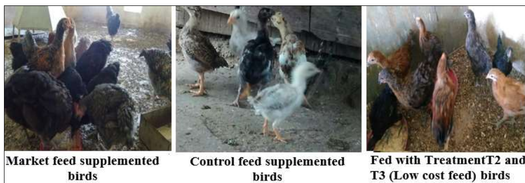
Fig 2: Weight gain by birds on 8 th week