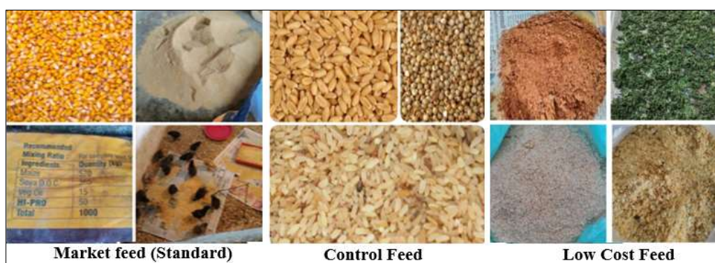
Fig 3: Feed material for chicks

observed that there was no adverse effect on their body and no mortality recorded compared with birds supplemented with control feed and market feed which showed 40% and 30% mortality respectively (Table 2).