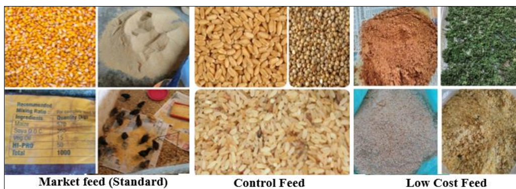
Fig 3: Feed material for chicks

observed that there was no adverse effect on their body and no mortality recorded compared with birds supplemented with control feed and market feed which showed 40% and 30% mortality respectively (Table 2).