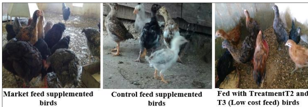
Fig 2: Weight gain by birds on 8 th week