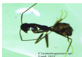
Fig 1: Crematogaster sp.