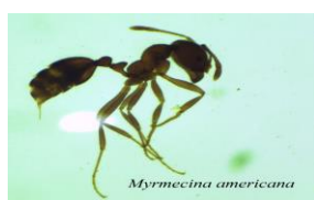
Fig 3: Myrmecina americana