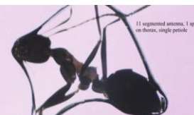
Fig 14: Dorymyrmex bicolor