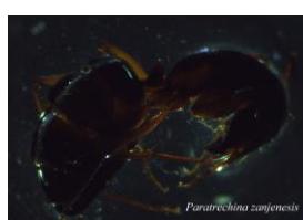
Fig 2: Paratrechina zanjensis