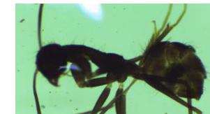
Fig 16: Leptogenys processionalis