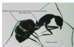
Fig 9: Forelius mccooki