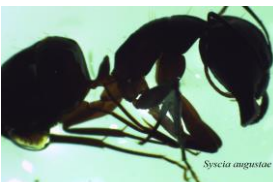
Fig 4: Syscia augustae