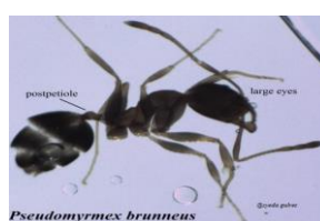
Fig 5: Pseudomyrmex brunneus