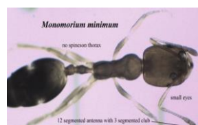
Fig 7: Monomorium minimum