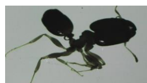
Fig 15: Pseudolasius diversus