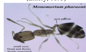
Fig 8: Monomorium pharaonis