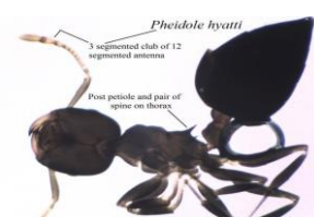
Fig 6.: Pheidole hyatti (Emery, 1895)