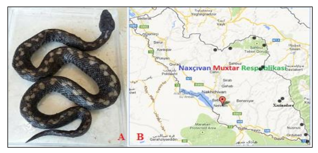
Fig 2: Distribution area of the Radde viper

Turkey, north-west of Iran. The species in Azerbaijan is distributed only on the territory of the Nakhchivan Autonomous Republic. It lives on mountainous areas of Shahbuz, Ordubad, Julfin and Babek districts. The species is especially often found in the territories of "Derebogaz" Shahbuz, "Gabagly also" Ordubad and "Khezinedere" Julfin districts. Two individuals were caught in "Hezineder" (Figure 2).