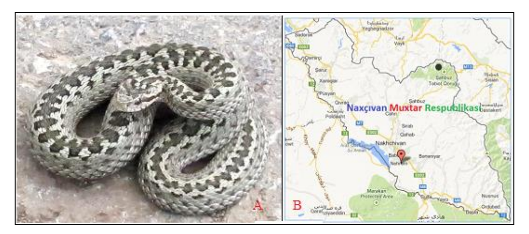
Fig 3: Distribution area of the Yerevan viper

Habitated biotopes: The view rises up to 3000 m. above sea level Inhabits grassy and stony areas. Sometimes it is observed in forested places and bushes. Winter hibernation is spent in rodent burrows, rock cracks, etc.